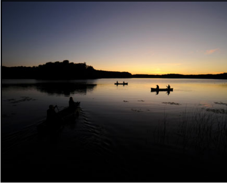
Located on picturesque Whaletail Lake in Minnetrista, (above) Gale Woods Farm (below) features a unique educational opportunity where visitors of all ages will gain an understanding of agriculture, food production and land stewardship.