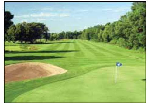
Anoka County's Chomonix Golf Course is one of the facilities featured in a virtual tour.

highlight facilities, amenities, and park entrances, in an effort to familiarize the public with what the parks have to offer. The hope is that this will in turn bring more people out once they see what things the Department has offer. The funding for this project is from the Minnesota Department of Health, as part of the Statewide Health Improvement Program.