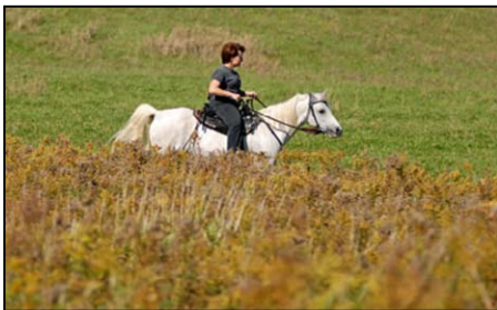
At 4,900 acres, Elm Creek Park Reserve is the largest of Three Rivers' parks.

With facilities for every season, including picnicking, swimming, play areas, boating, fishing, downhill skiing, snowboarding, golfing, camping, and sledding, Three Rivers Parks is the place residents of Hennepin County and the region seek recreation, play and relaxation. Three Rivers Park District has developed an extensive trail system for hiking, biking, in-line skating, horseback riding, cross-country skiing, and snowshoeing. They also offer program sites for nature, recreation, historic, and farm education. The Park District serves 7 million park guests per year.