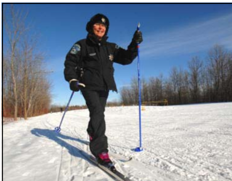
Park Service Officers are uniformed, non-sworn officers who patrol the parks and trails, provide limited Ordinance enforcement, and serve as a resource to guests.

Habitat management activities are essential for maintaining viable populations of wildlife and include the establishment and maintenance of na-