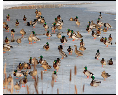
The Wildlife Management Division of the Natural Resources Department is responsible for maintaining wildlife populations within the Park District through habitat management, reintroductions, management of species of special concern, population control, and general monitoring.

tive plant communities and their associated wildlife.